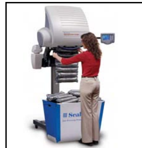
SpeedyPacker® Foam Packaging System