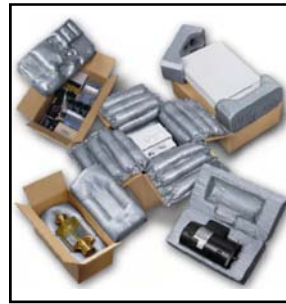
Instapak® Foam Packaging