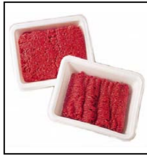
Cryovac® Case Ready Packaging Systems