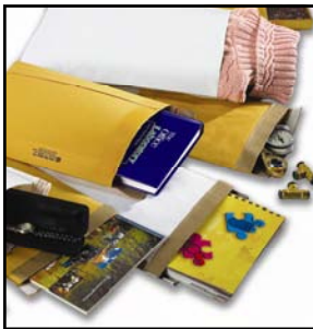
Jiffy Mailer® Products