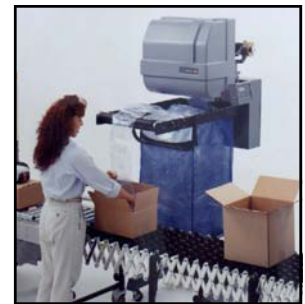
Fill Air™ Inflatable Packaging and Systems