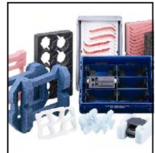
CelluPlank® Polyolefin Foam Stratocell® Laminated Foam