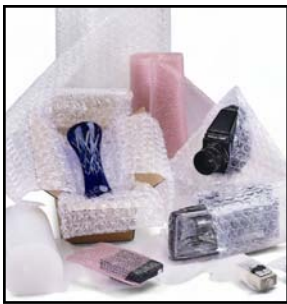
Bubble Wrap® & AirCap® Air Cellular Cushioning

Sealed Air's industry-leading investment in research and development and constant focus on World Class Manufacturing principles allow us to continue to deliver innovative packaging solutions that add measurable value to our customers' businesses around the world.