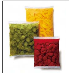
Cryovac® Flexible Pouch Systems