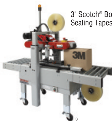
3" Scotch® Box Sealing Tapes